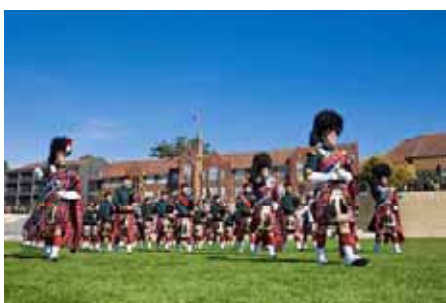
Knox Anzac Day Parade 2008

In the Senior School in 2008 the three new Senior Academic Masters for Stage 4, 5, and 6 continued to define their roles and to work in conjunction with the School Executive Team, Deans and the Year Masters and Tutors.