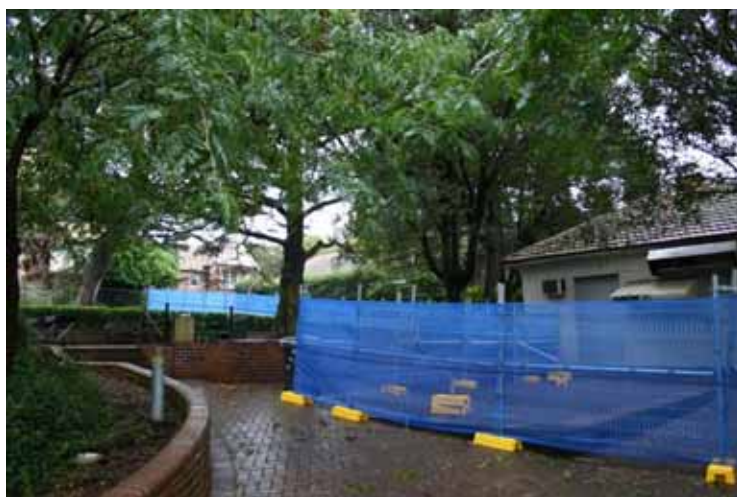
Fencing surrounding the old Dining Hall, Gillmore Boarding House and the old Clinic in preparation for demolition to make way for the new Knox Boarding Centre due for completion early 2010.

Secretary Knox Grammar School Council 2008