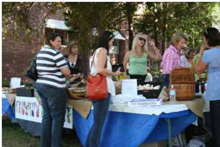
The Boarder’s Country Fair Stall, one of the popular attractions At the Knox Parent Association’s Annual Gala Day