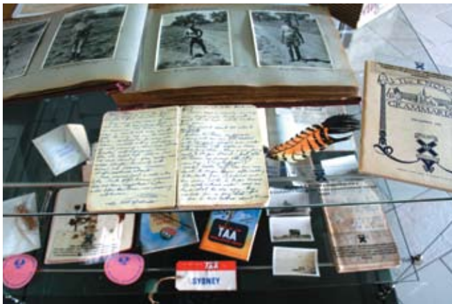
Memorabilia on display from the 1950 Central Australian Expedition