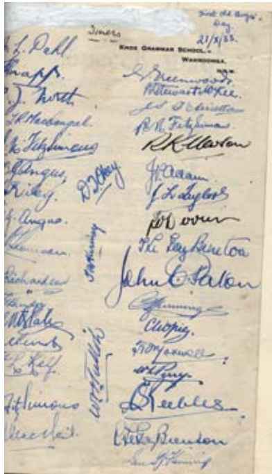
Autographs collected at the dinner held after the 1st Old Boys Day in 1933