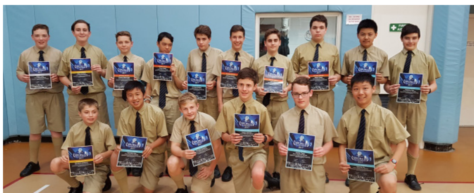
Above: Certificates presented during the Year Meeting to boys for Language Perfect scoring in the top 20%.