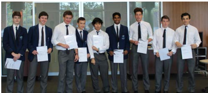
Boys receiving their Duke of Ed Award Certificates at Year Meeting