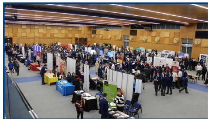
Above: Knox Careers Night