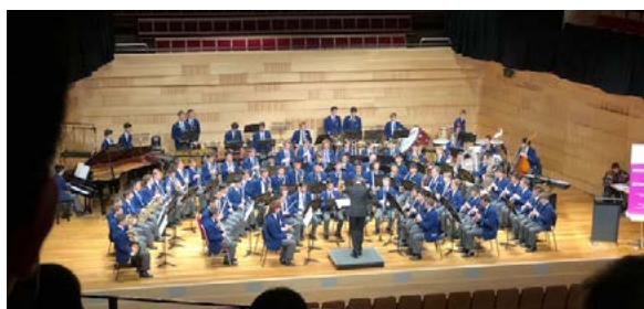
Knox Symphony Orchestra and SWE on stage