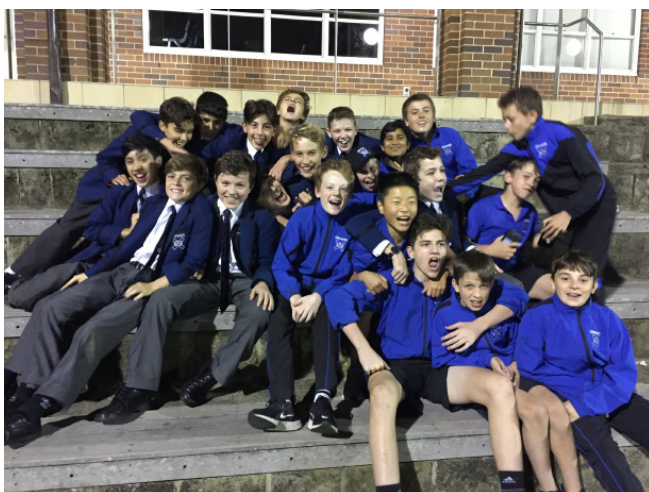
Above: Year 8 boys thoroughly enjoying Football under lights last Friday night