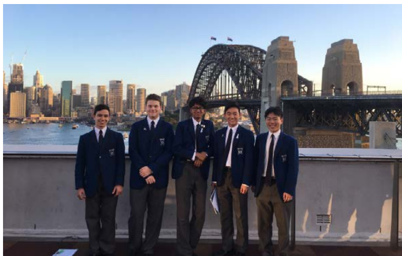
Above: Mock Trial team at St Aloysius last Wednesday.